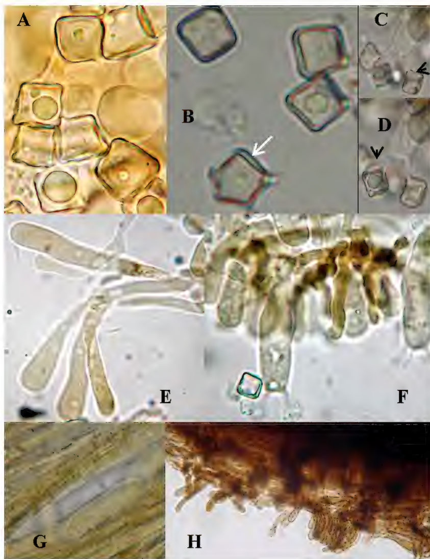
PLATE 2. Inocephalus virescens . A: Basidiospores (DLL 9772); B: Basidiospores 4-angled, 5-angled dorsi-ventral view (white arrow) (DLL 9772); C: Basidiospore in profile view (DLL 9771); D: Basidiospore in dorsiventral view (DLL 9771); E: Pigmented cheilocystidia (DLL 9772); F: Basidia and pseudocystidia originating from oleiferous hyphae (DLL 9772); G: Tramal hyphae with lipid bodies (DLL 9772); H: Stipitipellis showing caulocystidia as terminal cells (DLL 9772).